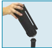
Replace your graphic as your message changes!