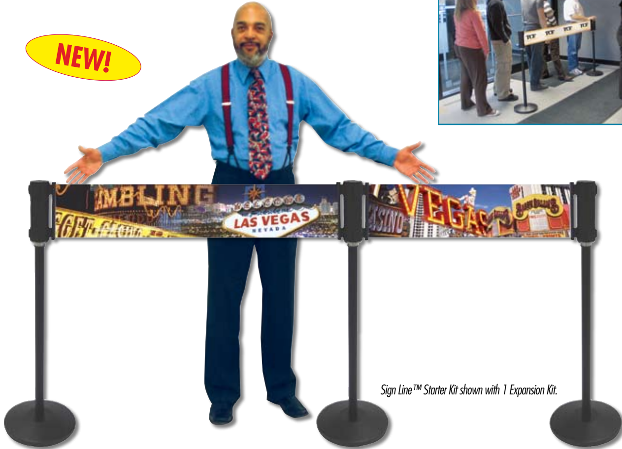
Sign Line™ Starter Kit shown with 1 Expansion Kit.