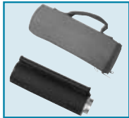
Case Included to protect your graphic cartridge.