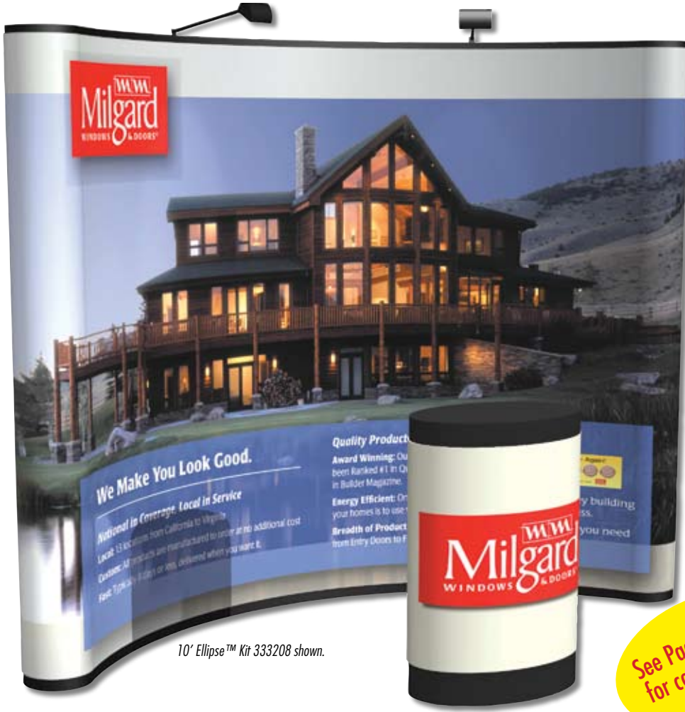
10' Ellipse™ Kit 333208 shown.