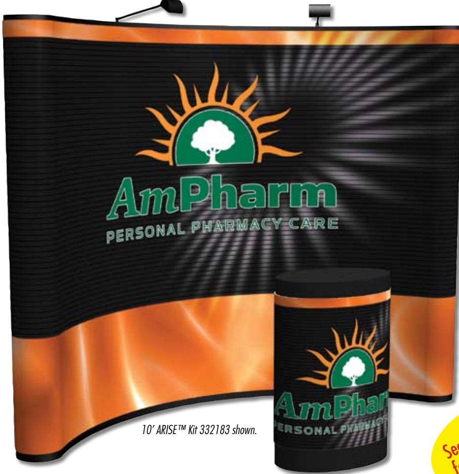
10' ARISE™ Kit 332183 shown.