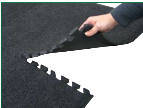
Exclusive interlocking tabs make assembly easy!