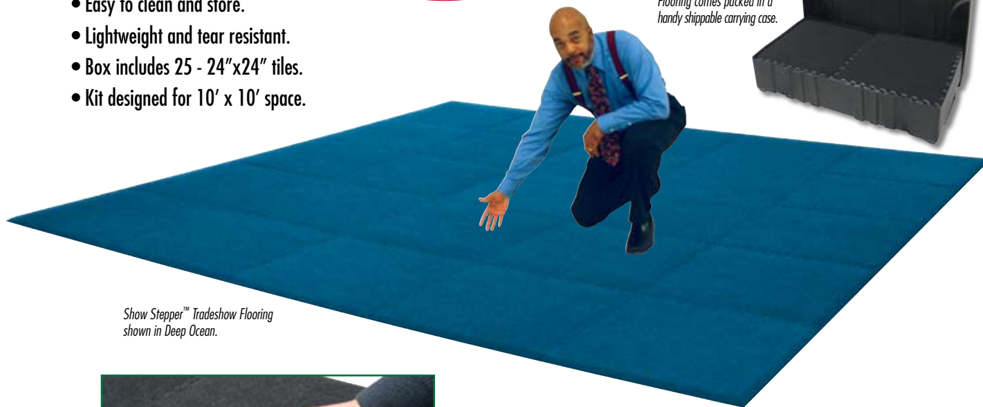
Show Stepper™ Tradeshow Flooring shown in Deep Ocean.

Show Stepper™ Tradeshow Flooring comes packed in a handy shippable carrying case.