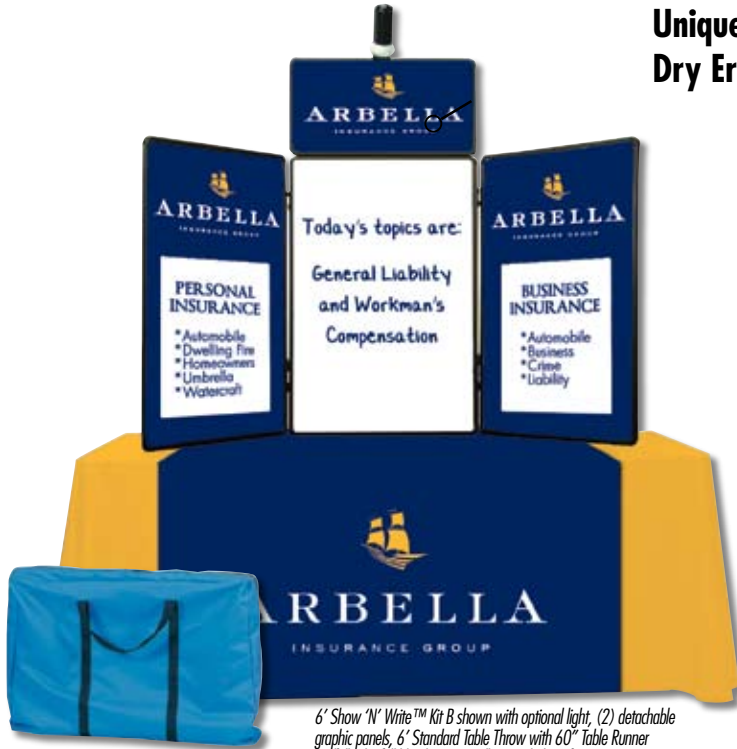
6' Show 'N' Write™ Kit B shown with optional light, (2) detachable graphic panels, 6' Standard Table Throw with 60" Table Runner w/full-color full bleed imprint. All Kits include Soft Carry Case.

Unique 'dual purpose' presentation solutions utilizing Dry Erase board and Velcro® receptive fabric.